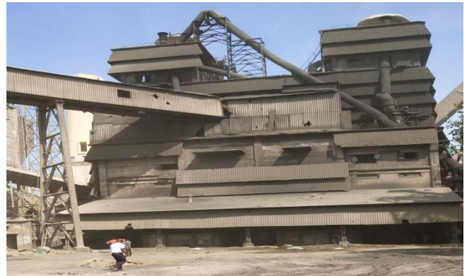
6. COOLING UNIT