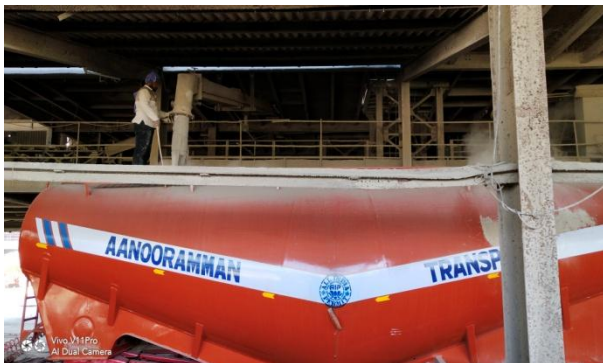
7. LOADING PROCESS