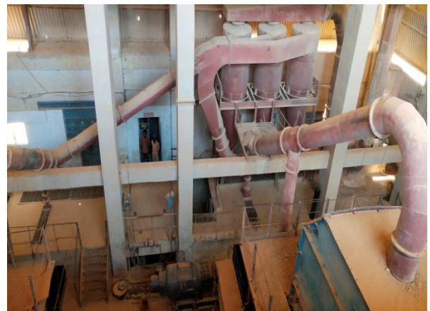
2.RAW MATERIALS CRUSHING UNIT