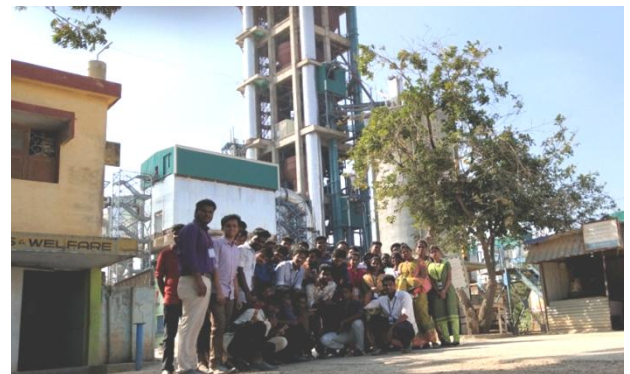
8. END OF VISIT