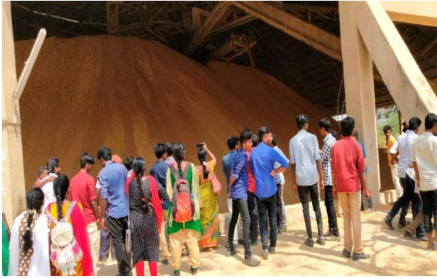
3. RAW MATERIALS STORAGE