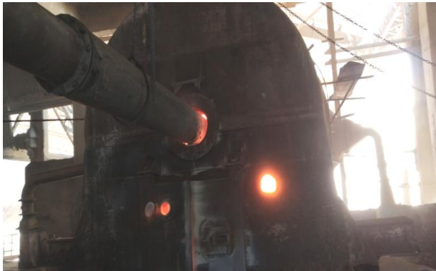
5. HEATING PROCESS- ROTATRY KILN