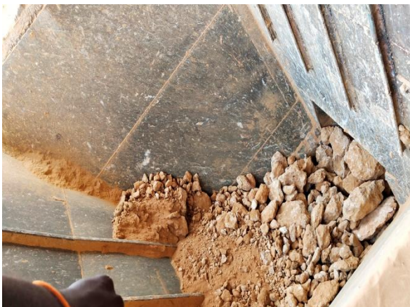
1.RAW MATERIALS COLLECTION